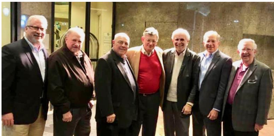
Past Consuls and a former Executive Director reunite in February 2019 (Atlanta, GA)