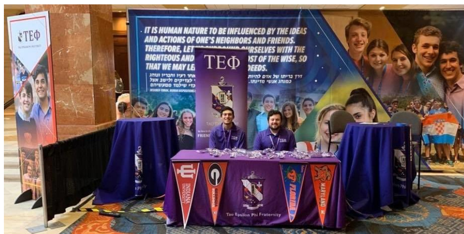
TEP at BBYO International Convention - February 2020

Contact the Executive Director at tsmith@tep.org to discuss next steps.