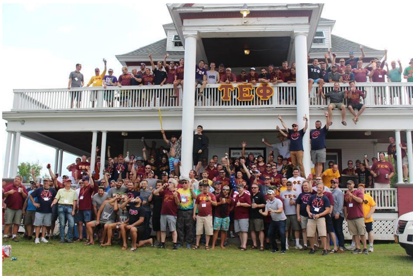
Lambda Phi Epsilon (Clarkson University) 50th Anniversary & Alumni Reunion, 2017