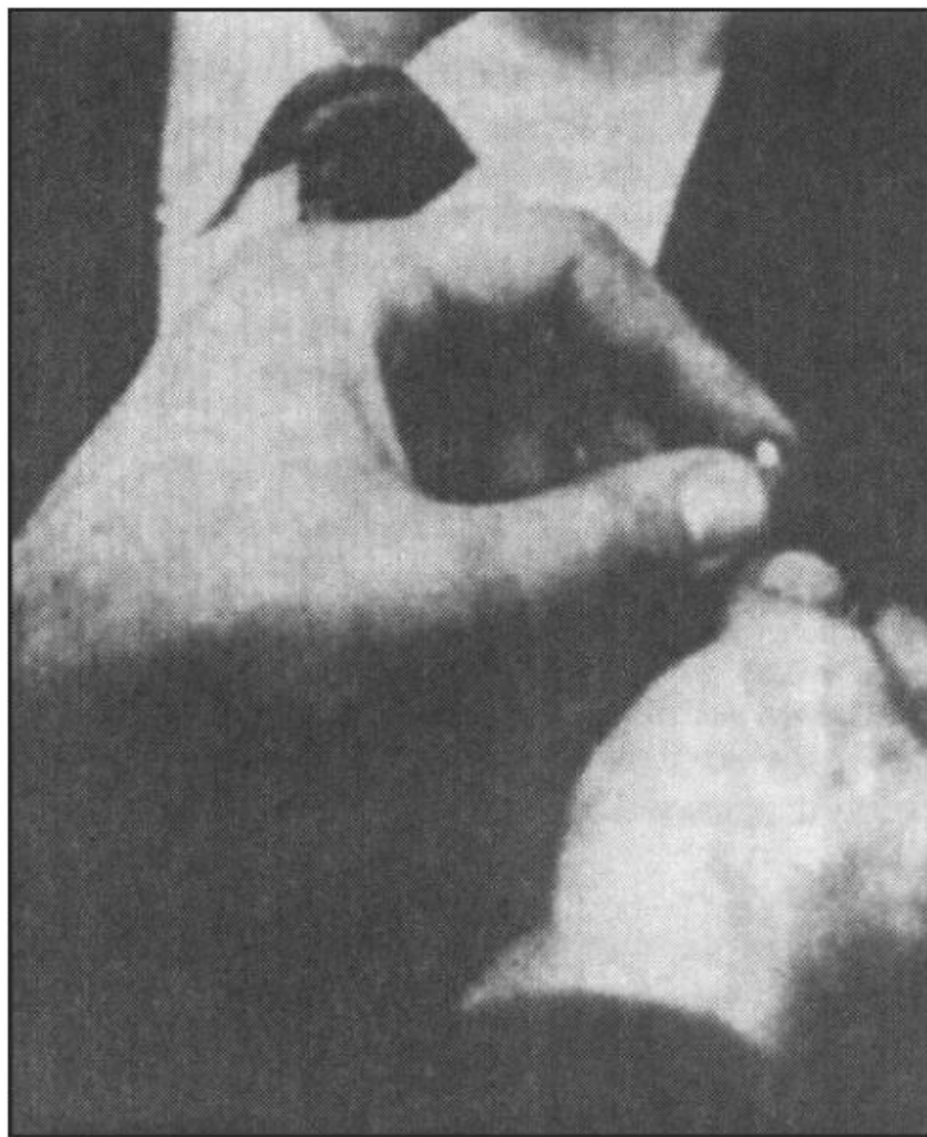
“Ode to the Candidate”