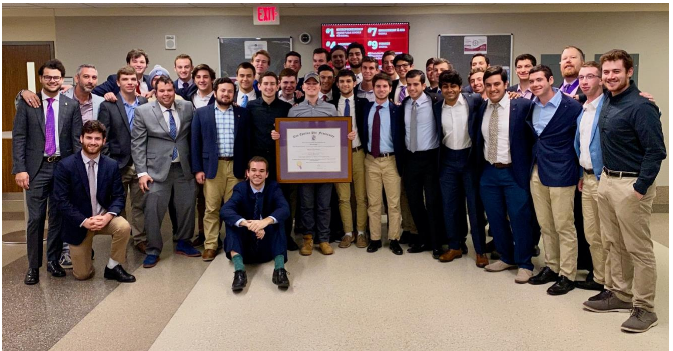
Gamma Tau Chapter (University of Indiana), at their chartering November 2019

TO PRACTICE each day friendship—chivalry—service—thus keeping true to these—the three ideals—of the founders of our fraternity—this is the Creed of Tau Epsilon Phi.