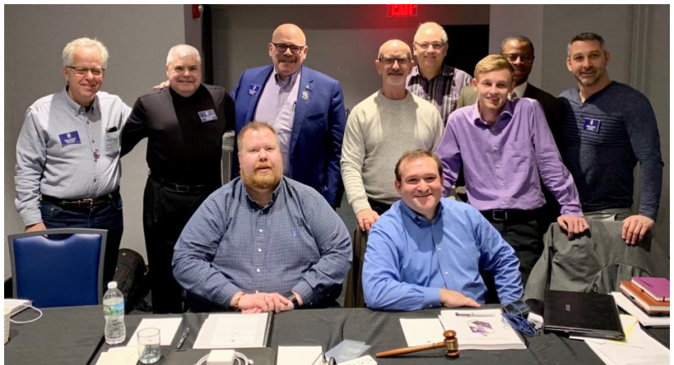
Grand Council & Executive Director at a 2019 Grand Council meeting (New York, NY)