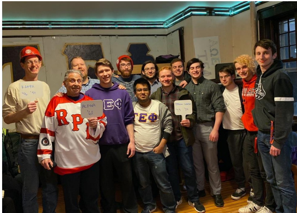
Epsilon Iota Alumni Reunion 2019

Local groups should not limit themselves to just one advisor; It is wise to have a team of dedicated alumni known as an Alumni Advisory Board . The larger your network of advisors, the greater your support system. Therefore, it is imperative to repeat steps 1-8 to secure as many qualified alumni advisors as possible. Keep in mind, that National is always willing to assist in this process.