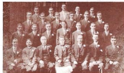
How We've Grown!