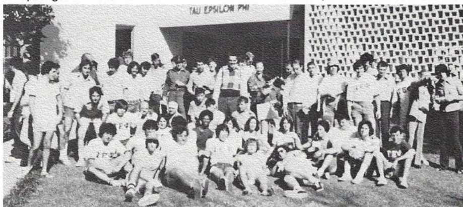
Tau Alpha Pledge Class