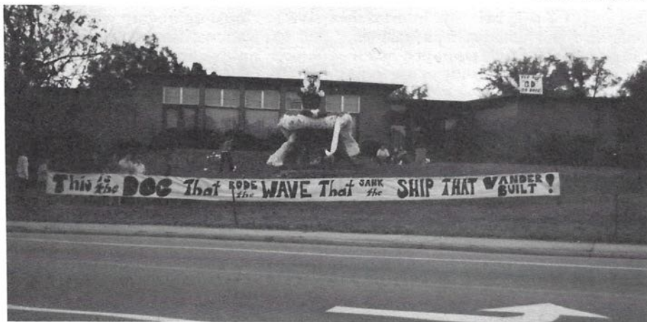
Nu Chapter's prize winning Homecoming Display at the University of Georgia's Homecoming