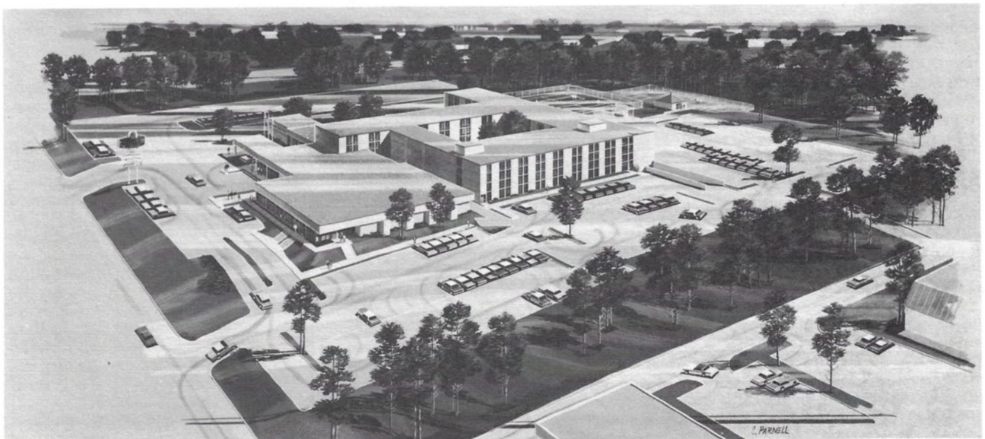
RADISSON OLYMPIC INN I-285 & Chamblee-Dunwoody Rd., Atlanta, Georgia

FOR those of you who have had a yen to see what the "next great city of the world" is really like—now is your chance. From Wednesday, August 20th to Sunday August 24th, 1975, the third biennial concurrent TEP and DPhiE international convention will be held in the "Hub of the South"—ATLANTA, GEORGIA.