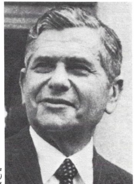
Bro. Irving R. Kaufman Epsilon (Fordham) Chief Judge of the U.S. Court of Appeals

In many legal and judicial quarters, Brother Kaufman is considered a prime candidate for elevation to the Supreme Court.